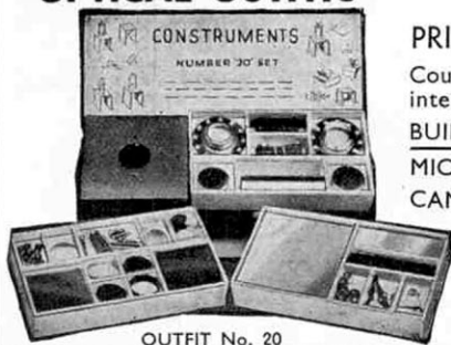
OUTFIT No. 20